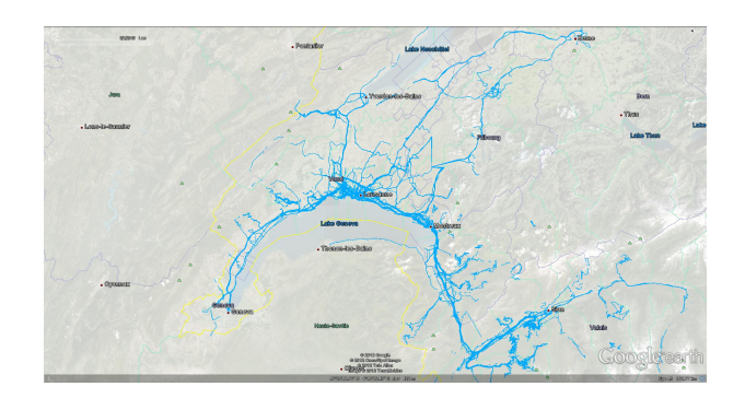
Figure 1: GPS tracks from January 1^{st} through April 30^{th} , 2010.<sup>1</sup>

In total, we use the records of 31 devices for the evaluation, which equals one device per 4123 people and 1.33 \text{ km}^2 , or 0.75 devices per km<sup>2</sup>. At first sight, these numbers suggest that we evaluate information distribution in a very sparsely populated region. This comparison holds true for distribution via Bluetooth, where messages are exchanged directly between two devices participating in the same piconet. However, the amount of WLAN access points, which allow indirect message exchange, resembles a well developed infrastructure. Even though the density of participating nodes is low, the available infrastructure can partially mitigate resulting problems (see Section 4).