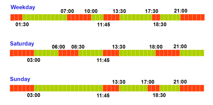
Figure 1: Day discretization

To capture these temporal trends, we first divided the week into three type of days: Weekday, Saturday and Sunday . Then, as shown in Figure 1, we built a different time discretization for each type of day. The bins represent the starting time of a visit. For instance, visits starting on a Weekday can fall into 9 different bins, and a visit starting between 7 a.m. and 10 a.m. will be assigned to bin number 3.