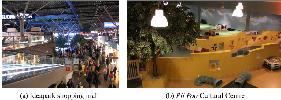
Fig. 1: Deployment locations