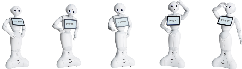
Fig. 2: Pepper robot