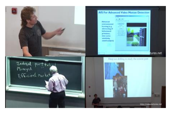
Figure 2: Sample snapshots from VideoLectures videos: Talk, Presentation, Blackboard and Mix.

On the other hand, videos from VideoLectures.net (Figure 2) are much longer with an average length of little bit more than an hour. The videos are usually recorded at a poorer quality. Besides, there are almost no shot transitions (the only ones being usually dissolvence or fades) and there is no clear separation between the segments, where the lecturer is talking and the ones, where the slides are shown.