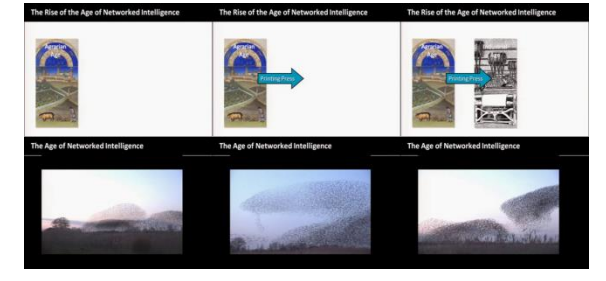
Figure 5: Horizontal animation (top) and video content (bottom) inside a presentation segment.

Figure 5 shows an example of animation and dynamic content inside a presentation.