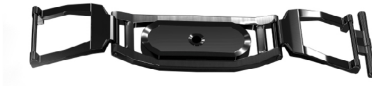
BIOWAVE watchband buckle

This project, scheduled over 18 months, debuts in February 2016 and is being produced with the financial support of CTI (Commission for Technology and Innovation), the federal agency responsible for the promotion of science-based innovation.