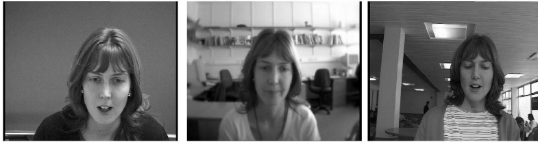
(b) BANCA English (uncontrolled conditions): complex background and lighting variability