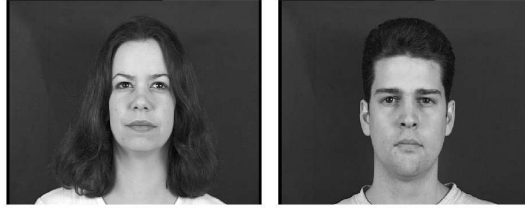
(a) XM2VTS (controlled conditions): uniform background and lighting